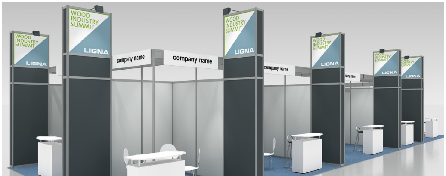
Illustration may contain additional features that can be booked optionally

All prices are subject to statutory VAT Legal basis: The Conditions for Participation in LIGNA 2019